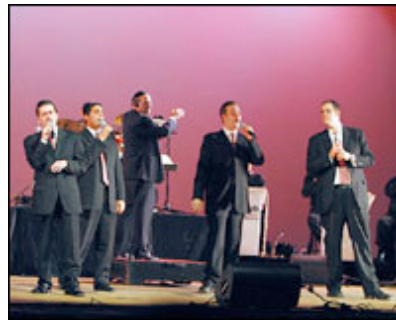
Shalsheles performs at the Sounds of Solidarity concert on Nov. 9, 2002.